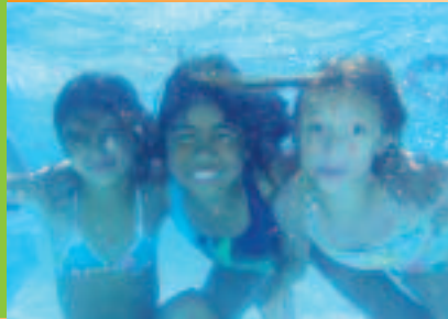
Just floating around