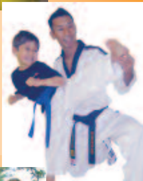
Helping students be their best