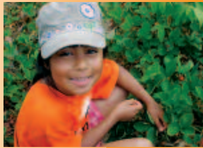
Smiling all the way

week 9# week 10# Mon _____ Mon _____ Tue _____ Tue _____ Wed _____ Wed _____ Thur _____ Thur _____ Fri _____ Fri _____