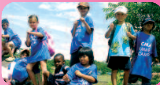
Educational outing to Ontario Place